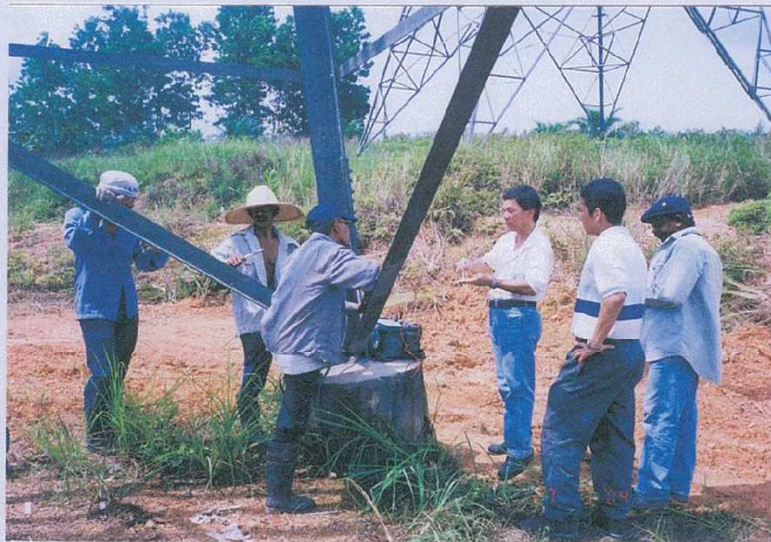
TNBT OFFICER EXPLAINS ON RESISTANCE MEASUREMENT