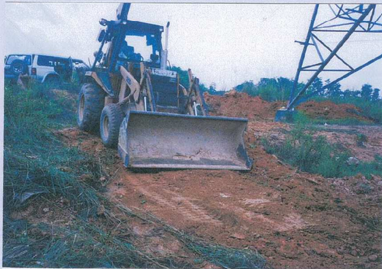
COMPACTING SOIL IN THE TRENCH - INSTALLATION COMPLETED -