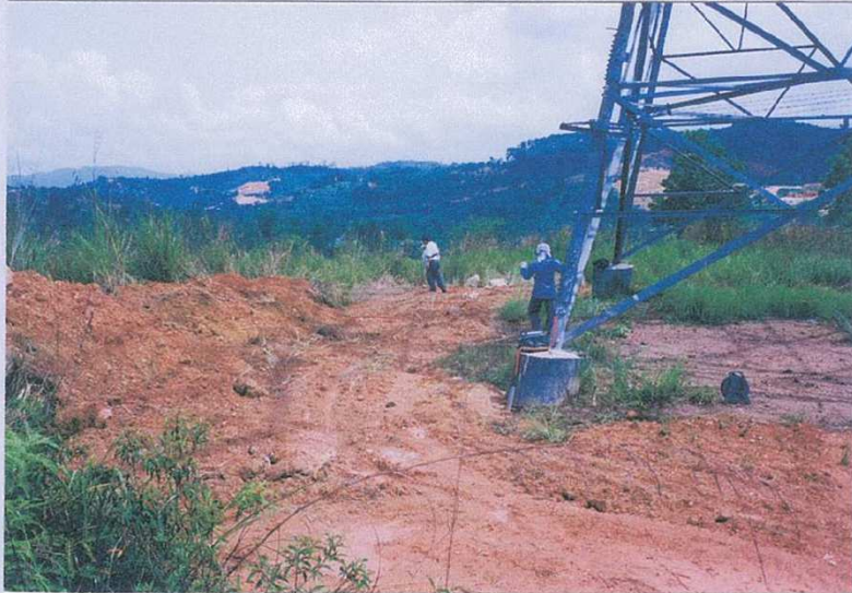
PREPARATION BEFORE MEASURING