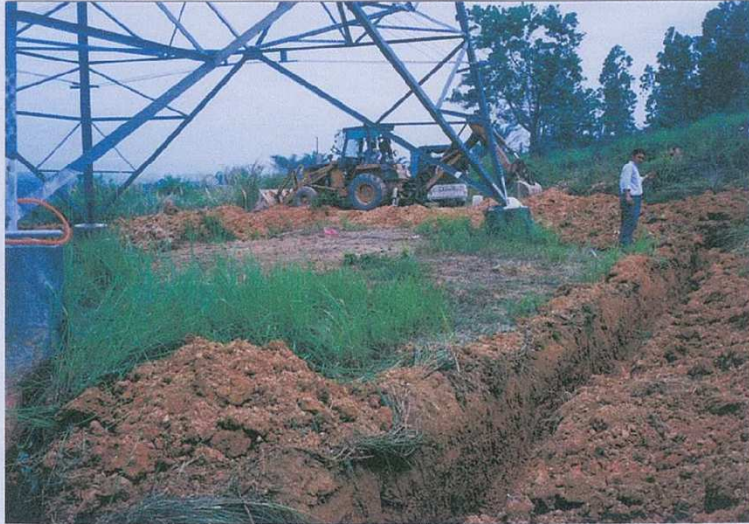
EXCAVATION WORK FOR TRENCH