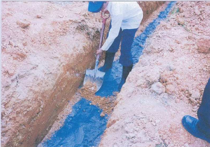
SPREADING SOIL CAREFULLY OVER SAN EARTH