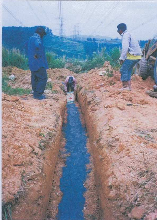
SPREADING SAN EARTH OVER WIRE CONDUCTOR