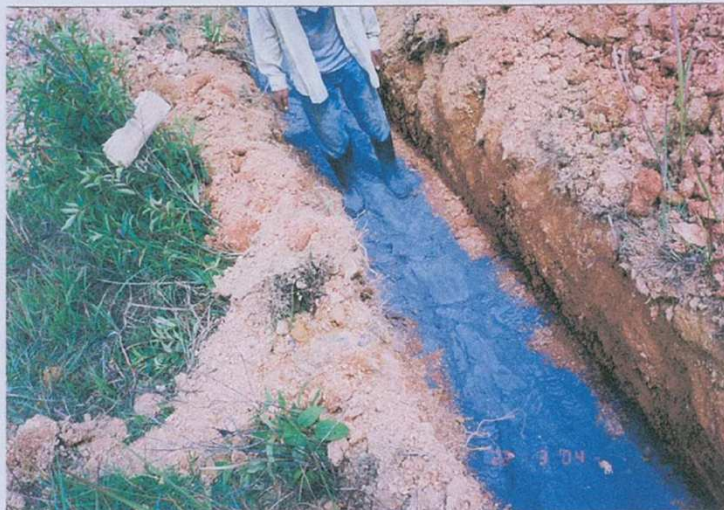
ENSURING WIRE FULLY COVERED