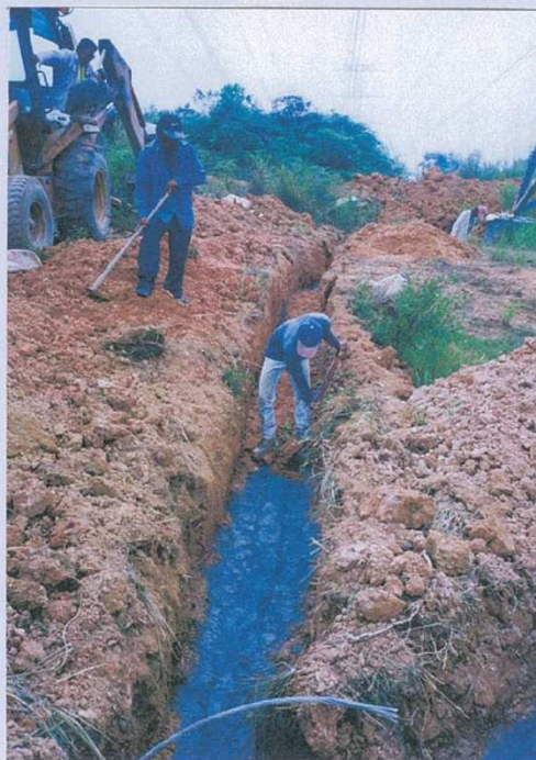
BACKFILLING TRENCH CAREFULLY