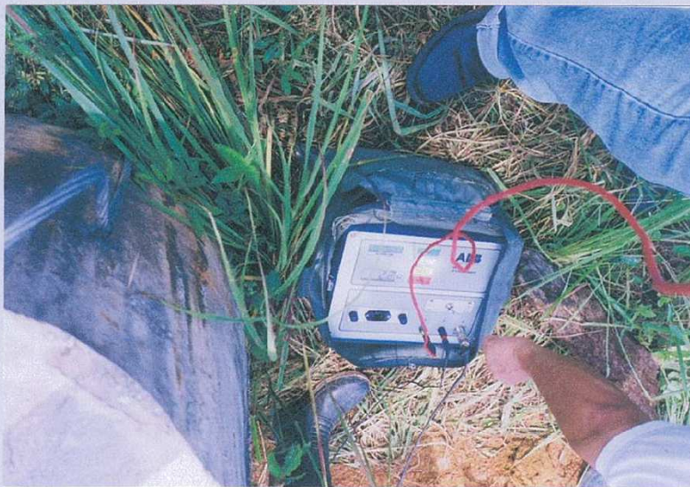
MEASURING TOWER RESISTANCE