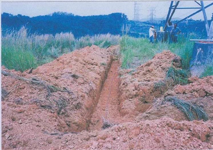
LAYING STEEL WIRE IN TRENCH