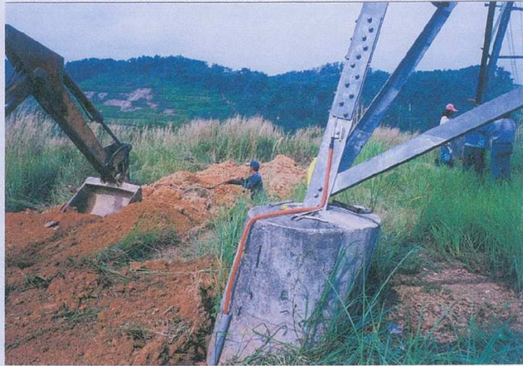
CONNECTING WIRE TO TOWER